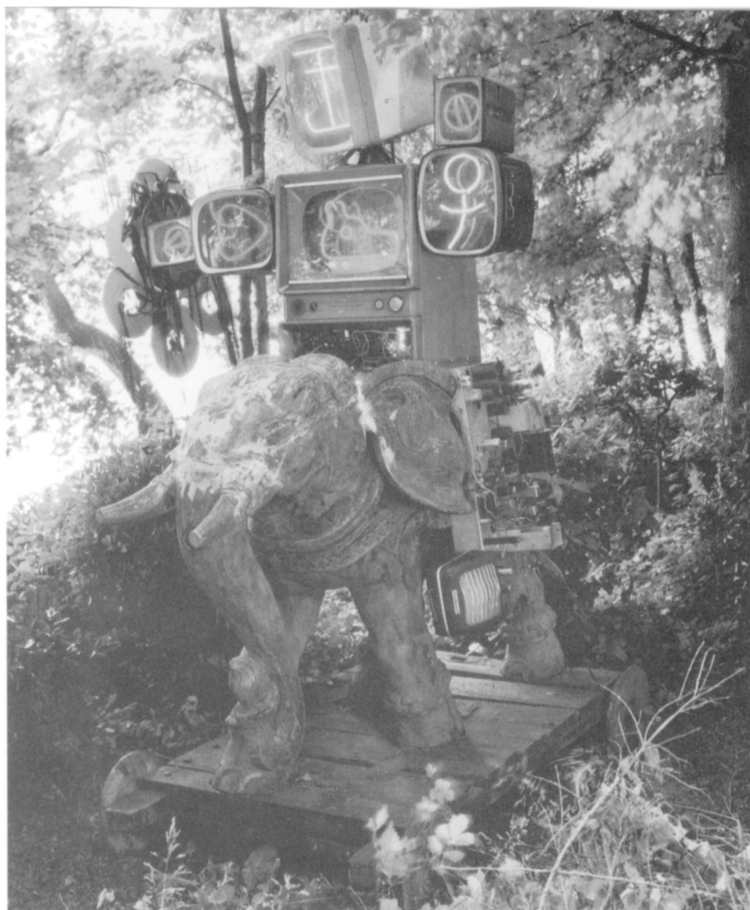
FIG. 4 Nam June Paik, Alexander the Great, 1993, mixed-media video sculpture.

old TV sets, are all about history—the history of design, of art, of TV’s centrality to our lives. They are a tribute to the past and a commentary on the present. The Family of Robots series speaks to TV’s fifty years of familialism, the news, network, and sitcom families. Unlike the movies, which are about romance and the youthful couple, TV constructs extended families, often including several generations.