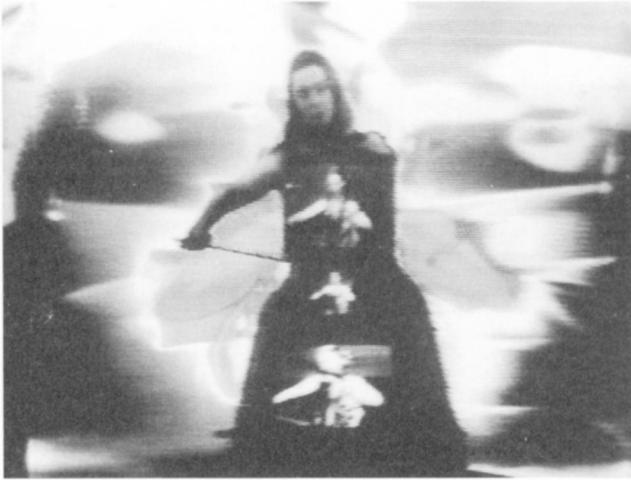
FIG. 1 Nam June Paik, Global Groove , 1973, color video, 28 minutes. Distributed by Electronic Arts Intermix, New York.

except for Andy Warhol, who always saw art as business: "Business art is the step that comes after Art." 6