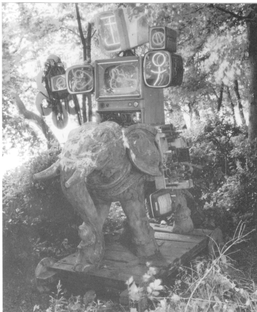
FIG. 4 Nam June Paik, Alexander the Great , 1993, mixed-media video sculpture. Courtesy Carl Solway Gallery, Cincinnati, Ohio.

old TV sets, are all about history—the history of design, of art, of TV’s centrality to our lives. They are a tribute to the past and a commentary on the present. The Family of Robots series speaks to TV’s fifty years of familialism, the news, network, and sitcom families. Unlike the movies, which are about romance and the youthful couple, TV constructs extended families, often including several generations.